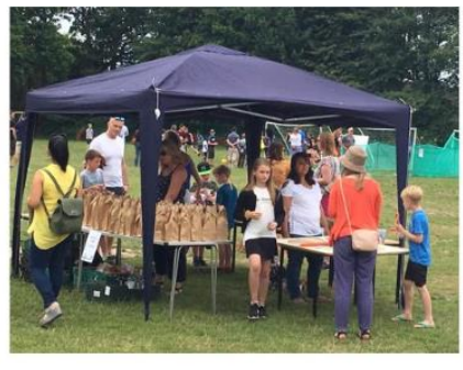
Summer Fair 2019