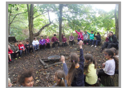
... and at one with nature in the forest.

All of your belongings must be clearly marked with your name and class to ensure that nothing becomes lost.