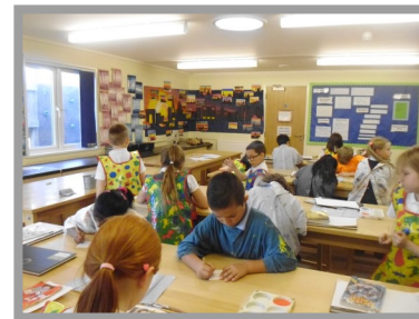
We love to get creative in our Art Room...

Please note that ear-rings are not permitted during any sport sessions and must be removed at home before attending school that day.