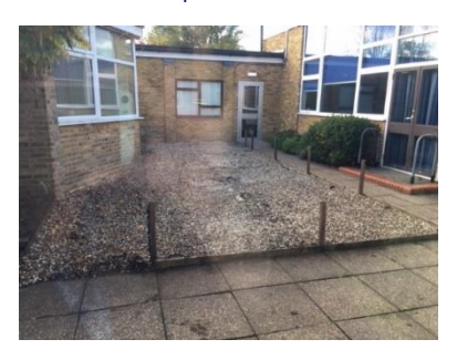
St Paul's C of E Junior School is committed to safeguarding and promoting the welfare of children and young people and expects all pupils, staff, volunteers, visitors and external agencies to share this commitment.